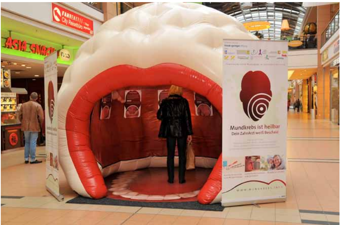
Figure 3: Image of the walk-in model of a mouth