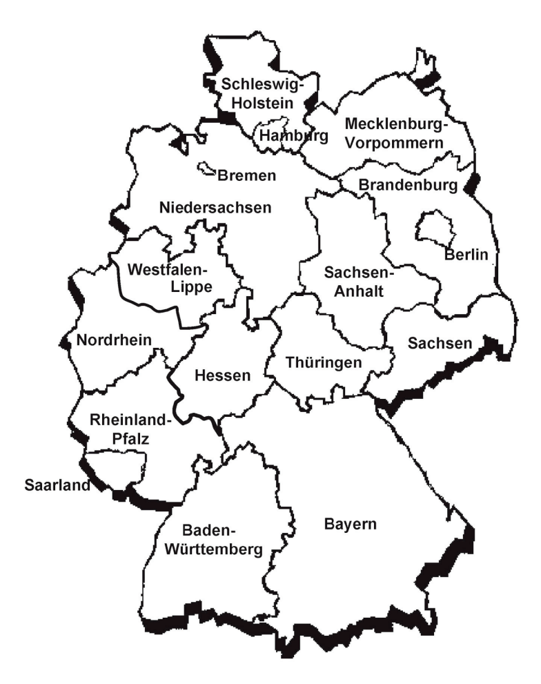
Figure 1. German map showing the different federal states following reunification in 1990.